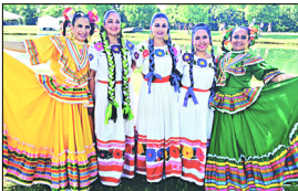
Canton Commission for Culture, Arts and Heritage.

The event is presented by the all-volunteer Multicultural Committee of the