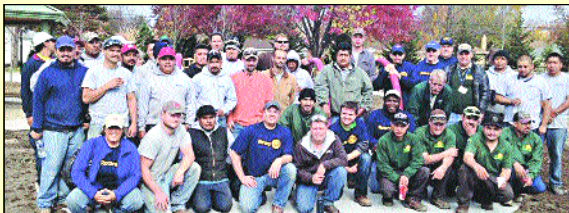
Volunteers, including professional landscapers, from the Plymouth Noon Rotary Club stepped up to aid the efforts to build gardens and playgrounds at the First Step shelter in Wayne.

The professionals issued a challenge to the Rotary membership, noting that for every volunteer from the club, they would bring one of their staff members to help with the