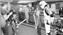
The third annual Star Wars Reads Day is set for this Saturday at the Plymouth District Library, including supervising stormtroopers.

Puyao will make upgrades and retrofit the plant with machinery along with repairs to the infrastructure and exterior at the site, although the basic footprint of the facility is not expected to change, officials said.