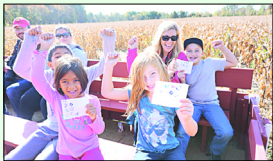
Visitors of all ages enjoy the corn maze at Maybury Farm every year, especially the wagon hayride through the fields.