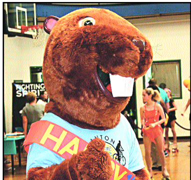
Bartlett the Beaver will celebrate his birthday with a party during the Canton Leisure Services Open House Aug. 26.

membership pricing. New Summit on the Park members whot register between Aug. 16 - Sept. 6 will have their one-time application fee waived (a $30 value); Discounted early-bird registration pricing on fall recreation programs and classes; entry into drawings for Family Prize packs, including family passes to upcoming Canton events, like the Trick-or-Treat Parade, Annual Tree Lighting, Santa Breakfast and Butterfly Ball; Health and wellness information regarding Pathway to a Healthier Michigan Grant opportunities and face painting, a bounce house provided by Awesome