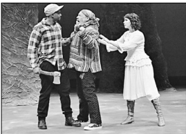
Members of the Michigan Shakespeare Festival will present As You Like It , Richard II and The Killer Angels at the Village Theater at Cherry Hill in Canton beginning tomorrow.

For additional information, visit www.cantonvillagetheater.org or call (734) 394-5300.