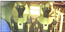
Prototypes for mummies used in movies The Mummy both one and two and in National Treasure with Nicolas Cage and Indiana Jones and the Crystal Skulls will be auctioned this Saturday.