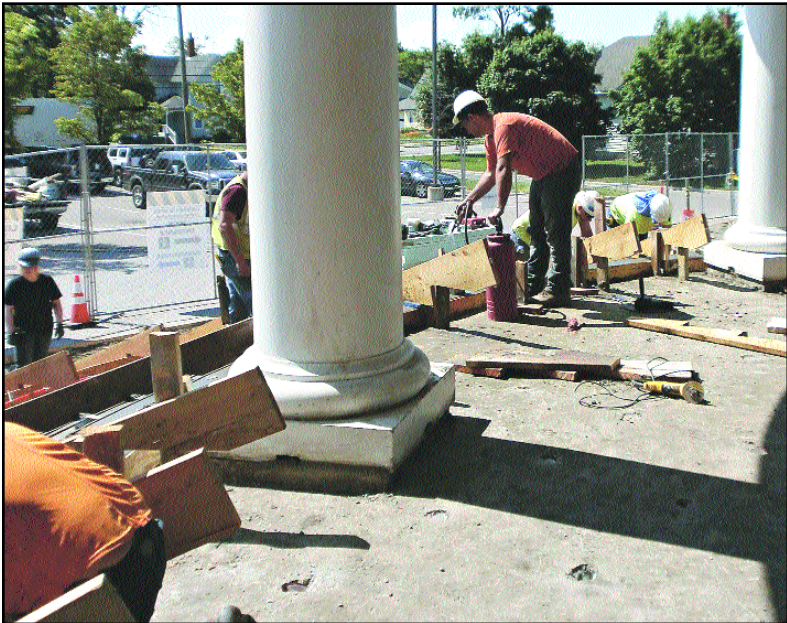
Construction continues at the Plymouth Library as planned renovations are under way and expected to be complete in July.