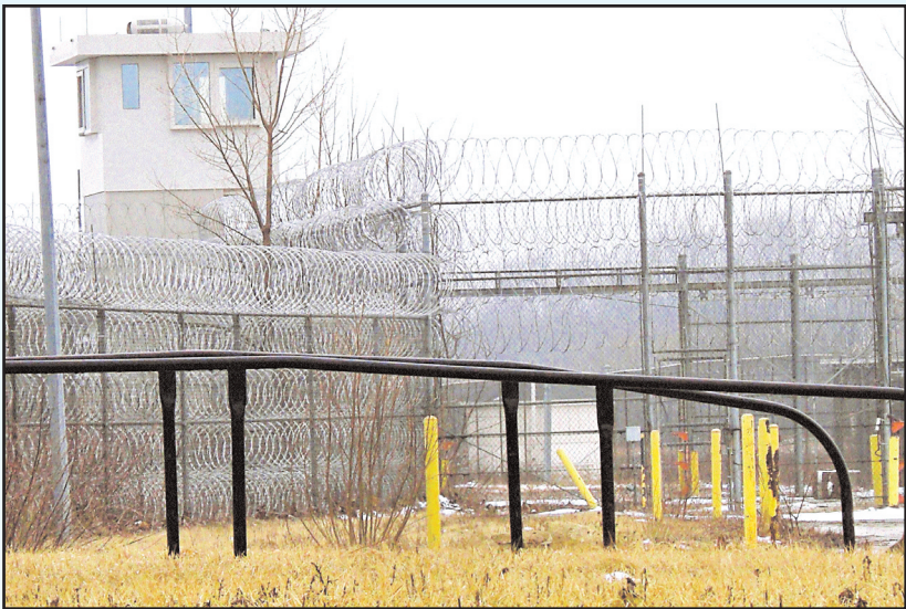
The former DeHoCo property is reportedly for sale by Plymouth Township despite a claim on the land by the City of Detroit..

The prison farmland is the 323 acre parcel located south of Five Mile Road between Ridge and Napier roads. The City of Detroit lawsuit was filed in April 2013. Detroit contends that following the 2006 sale of 133 acres on the eastern-most part of the 323-acre site to Demco 54 LLC, a property transfer affidavit was filed and a