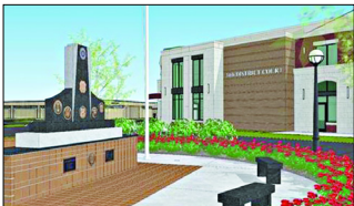
An artist's rendering of the new 34th District Court and Veterans Memorial in Romulus.