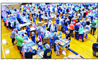
More than 1,500 volunteers are needed for the Greater Plymouth Service Project set for May 12 this year. Last year, 1,500 volunteers packed meals during the event.