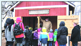
Visitors of all ages enjoy the creation of genuine maple syrup from tree sap they have helped collect at Maybury Farm where tours and demonstrations are now under way.

There the sap will be converted into maple syrup and experts will explain how the syrup is graded and how to try making the delicious treat at home.