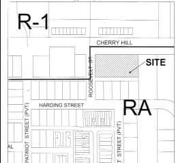
Zahr CHV Retail 073-PDM-3187