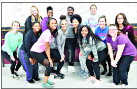
Candidates for the Distinguished Young Women of Wayne-Westland honors are all smiles for the camera.

The Wayne-Westland local program is part of the Distinguished Young Women of America, which is the largest and oldest scholarship program for high school seniors in the country. Since it first began in 1968, more than $106 million in cash college scholarships have been awarded