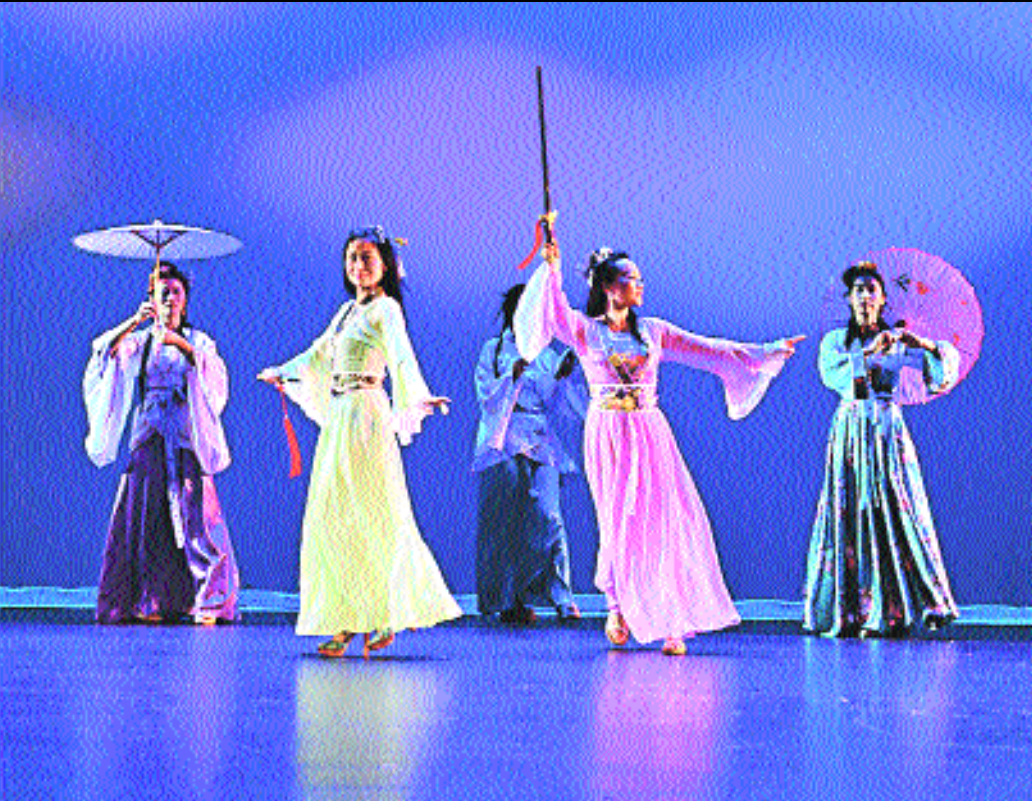
A traditional Chinese Fashion Show, featuring authentic Chinese clothing, will be a part of the New Year celebration of the Year of the Goat set for March 7 at The Village Theater in Canton Township.

Lunar New Year celebrations this year will say goodbye to the Year of the Horse and usher in another animal in the 12-year cycle of the Chinese zodiac - the Year of the Goat. The Chinese New Year, also called Spring Festival, has more than 4,000 years of history. Being one of the traditional Chinese festivals, it is the grandest and the most important festival for Chinese people, organizers