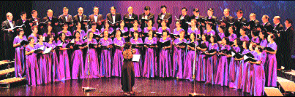
The famous Michigan Chinese Choir is among the many entertainment groups that will perform at the celebration of the Chinese New Year planned at The Village Theater in Canton Township March 7.