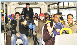
The Second Annual Black History Tour will leave Romulus City Hall at 4:30 Feb. 20 and stop at Underground Railroad sites in the city.