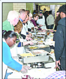
The Annual Soul Food Dinner attracted a large crowd of residents this week just as it did last year.

Hughes, an award-winning American poet, social activist, novelist playwright and columnist wrote "Tamboourines to Glory" in 1936 as a gospel play with music. The play premiered on Broadway in 1935. Tickets for the performances are $7 and can be purchased in advance or at the