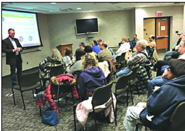
Audience members packed the meeting room to hear the presentation by officials from AM Data Solutions about the new police software being donated to the Wayne Police Department.